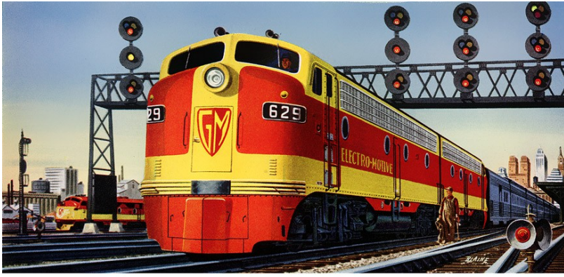
THE NEWEST GENERAL MOTORS DIESEL -world's most modern locomotive

Meeting Tuesday February 10th 7PM At the Museum Meeting Room.